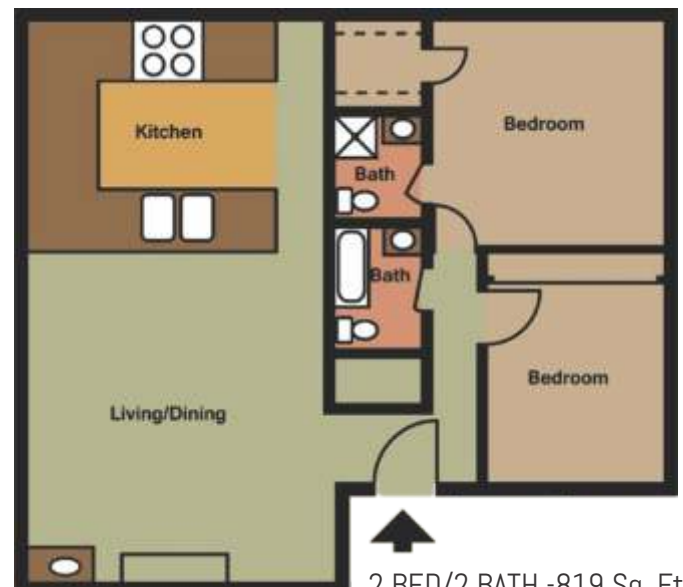
2 BED/2 BATH -819 Sq. Ft.*